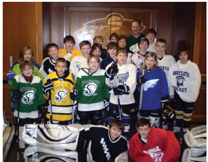
Kids on Ice hockey players