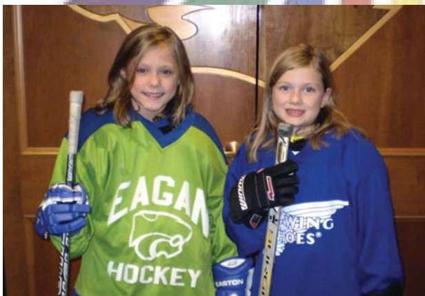
Youth girls hockey players