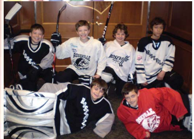
Roseville kids hockey players